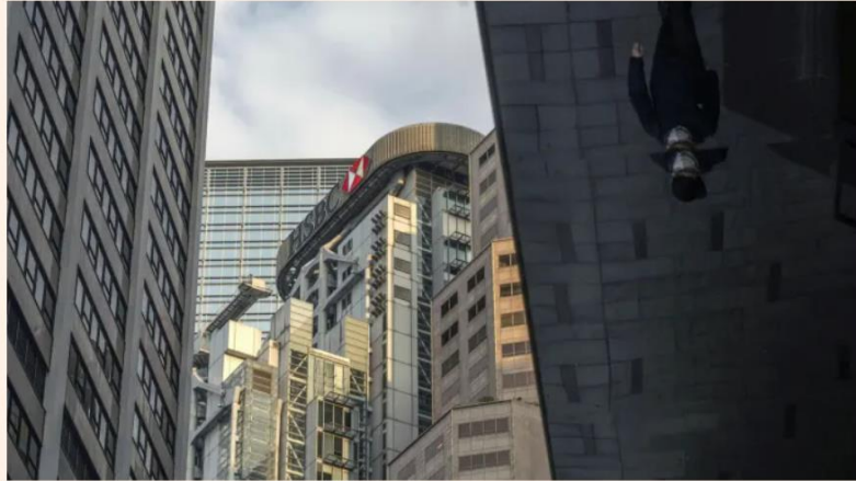
Shareholders are increasingly targeting banks over their role in financing carbon-intensive projects and industries

Investors file resolution demanding bank publishes strategy and targets