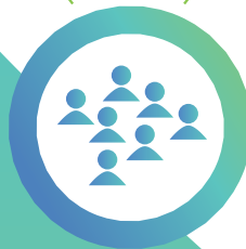
COMMITTEES AND PLATFORMS

Assists the President and CEO in exercising their duties. Comprises business leaders from various sectors of the economy.